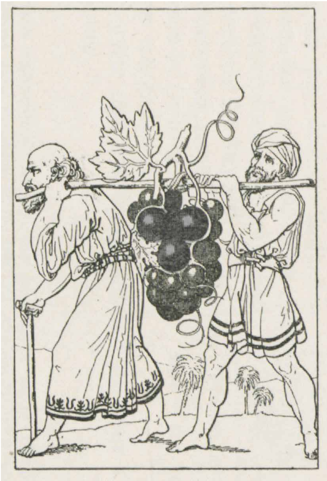
Fig. 2. Grape motif playing card, French, date unknown.