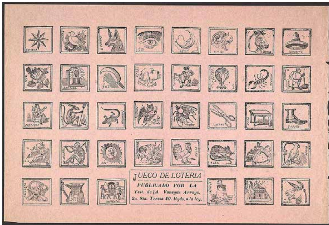
Fig. 4. Juego De Loteria c. 1905-20.