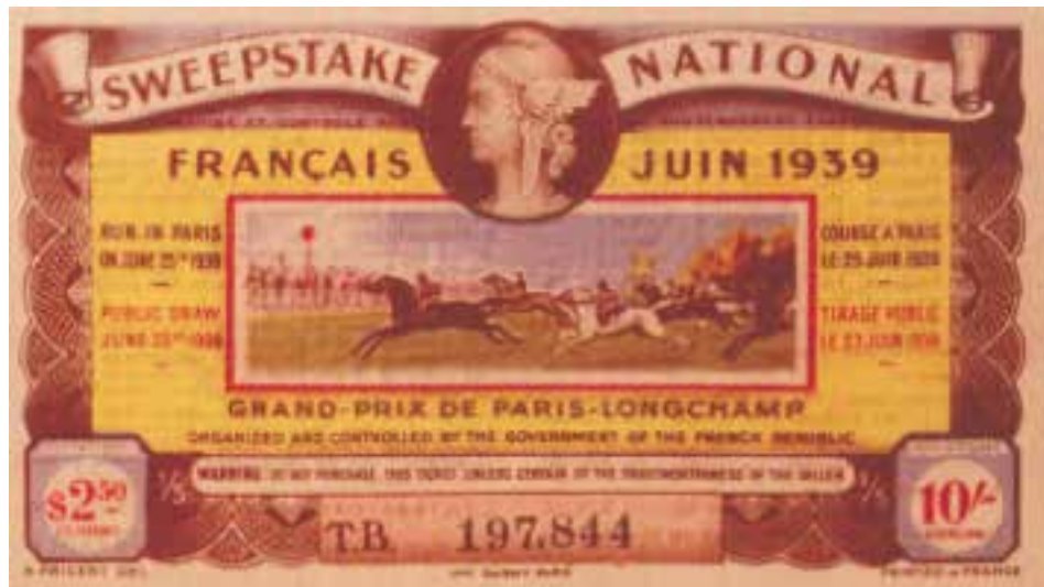
Fig. 5. 1939 Race sweepstakes presents pictorial modernism with a touch of art deco. Source GTECH Corporation “Lottery -- Art & Science”