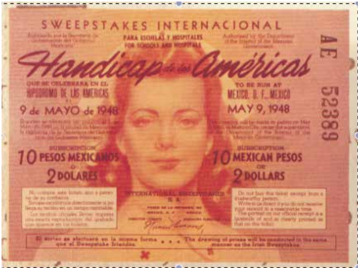
Fig. 6. Mexican schools and hospital lottery, 1948.