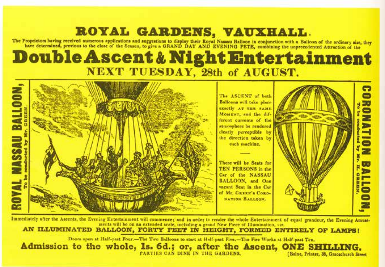
Fig. 1. Aeronautic adventure, the rich visual tells the story. c. 1851 Source Lewis, Printed Ephemera, p 116